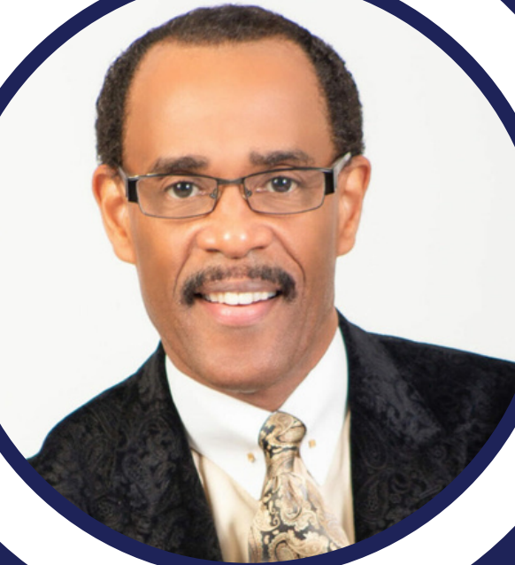
BISHOP GLENN PLUMMER